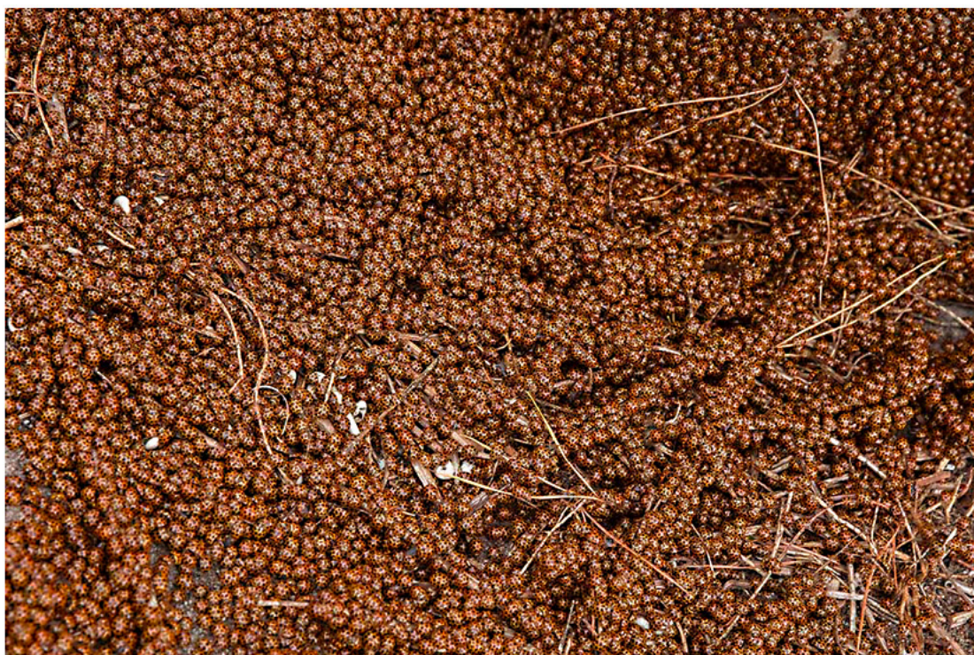
Ladybugs queuing for toilet break at their Mt Burr swarm, South Australia, 2019

Cycling's A-listers gathered 6.30 pm Tuesday 8 October to honour B-BUG club members who had risen to the very apex of their pedaling community in 2019, just like cream on milk, algae on ponds and eagles soaring high on spiraling thermals (by the way, that refers to air currents and not winter underwear). It was an evening to celebrate THE SWARM, amazing events wherein millions — nay, billions — of ladybugs cluster together to eat, drink, be merry and mate. David Attenborough, eat your heart out!