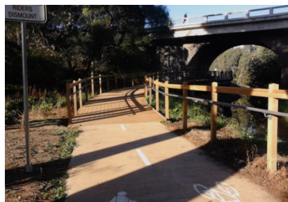
When it's separated by a walking track .