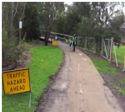
Entrance to the crash sight