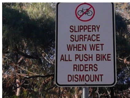
The new track linking the Darebin parklands which was presumably a bicycle track now displays these cyclists dismount signs.