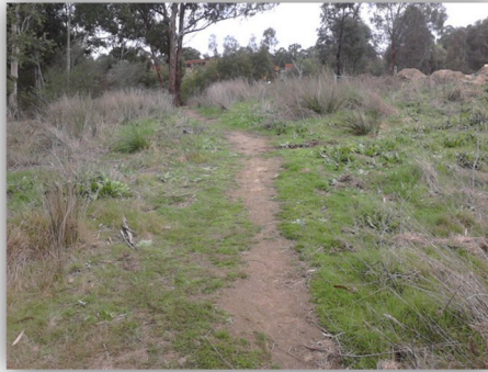
The dirt continuation of the path