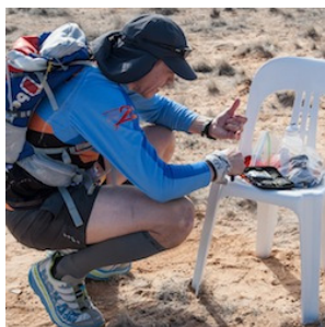
Blood Glucose testing

If you think we don't then, try doing the Big Red Run a 250K race across the Simpson Desert and then add into that type 1 Diabetes.