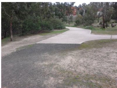
Path ends along the river adjacent to a housing estate in Diamond Creek