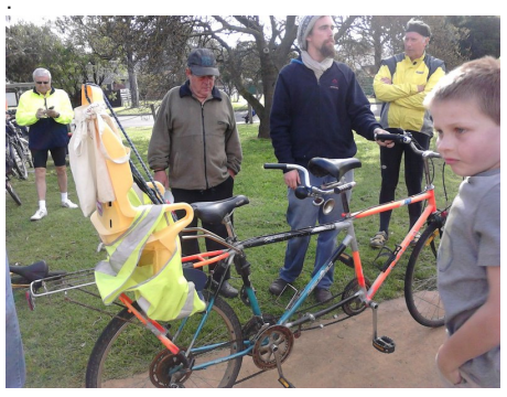
The Bug also attended an event on Wednesday July 4 when a number of Banyule Bug members lead a small group from NEMI on a short bike ride